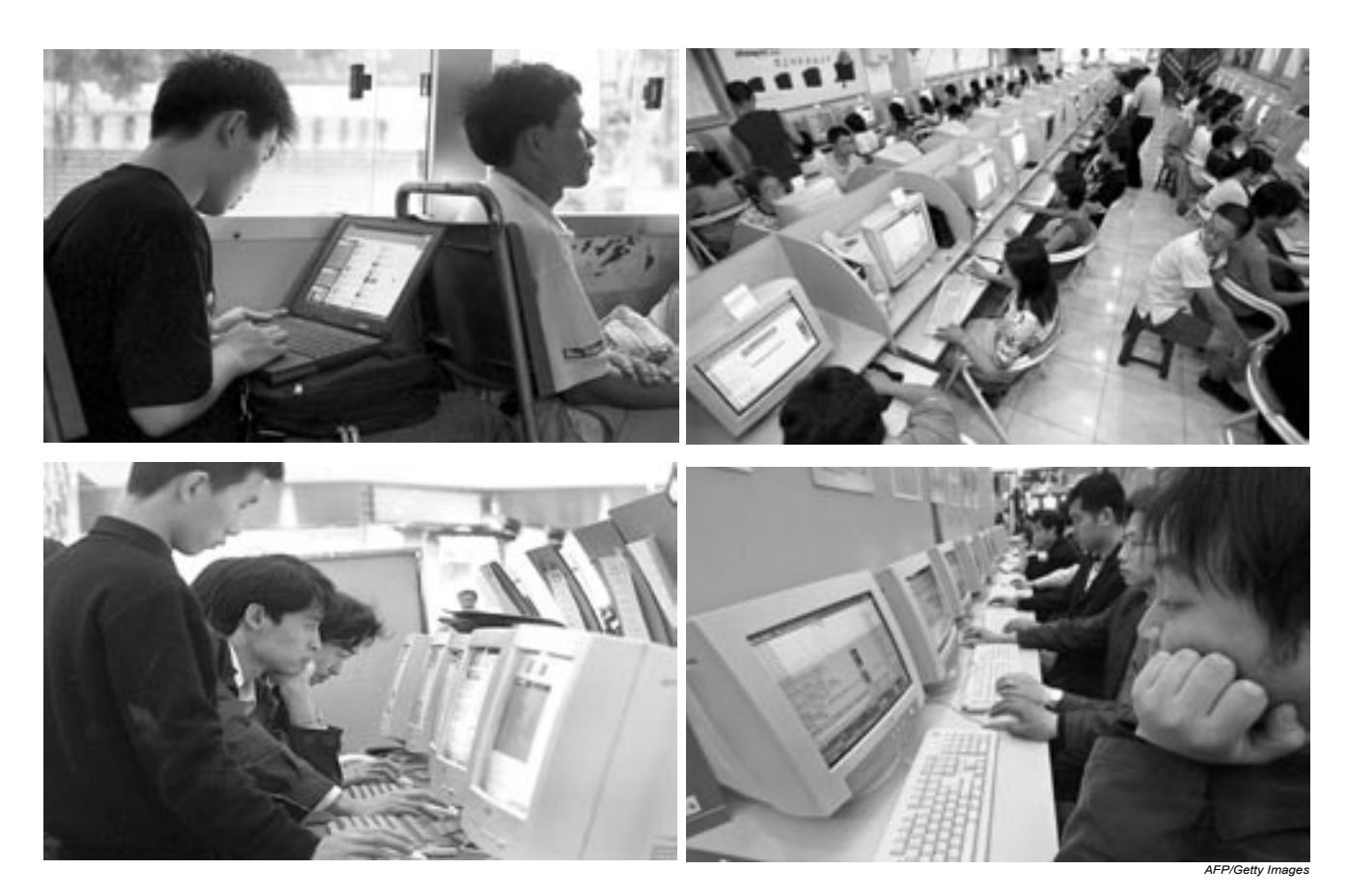
Young Chinese surf the Internet. China's Internet Service Providers (ISPs) are increasingly censoring their own content for subversive political material through so-called "self-discipline pacts." The China Internet Association said the agreements banned signatories from producing or releasing contents that are "harmful to national security and social stability" or illegal.

find on the ground along the street. I have also seen how the Communist Party officials squander resources. How can we expect them to serve the ordinary people? Please contact me. I want to work with you and be an example to awaken the numb Chinese. I do not know how to contact you. When I was young, I admired the police. I became a police officer only to find out the truth behind the title. How I long to get rid of the police uniform! To survive, I am still among them. The most disheartening is the plight of those who are imprisoned. Police who are supposed to uphold justice are actually committing crimes against them. There are no laws or principles—it is all up to the discretion of the Communist Party leaders. This is the Communist Party. It is not 'One mouse spoils one pot of porridge'—everything is totally spoiled."